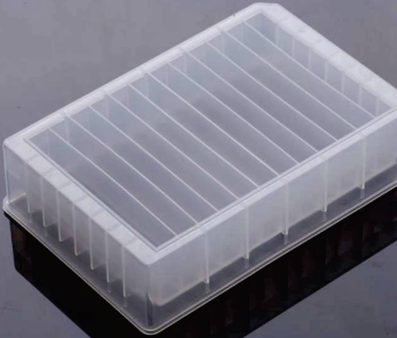
Deep Well Plates and Reservoirs