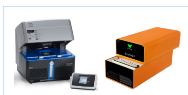
Thermal Cyclers and qPCR