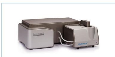
Particle Size Analyzer