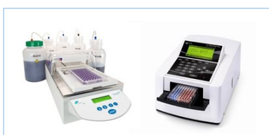
Microplate Readers and Washers