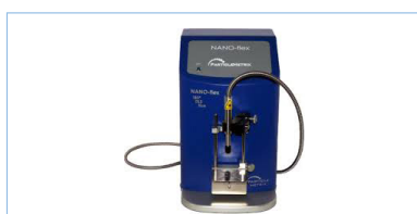
Dynamic Light Scattering