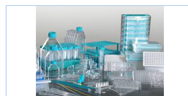
Cell Culture Plasticware