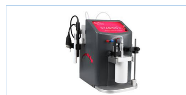
Colloidal Stability Testing