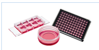
μ-Slides, μ-Dishes, Chamber Slides & more