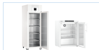
Frigides and Freezers