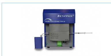
Nanoparticle Tracking Analysis