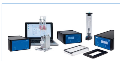
Heating, Incubation & Perfusion Systems